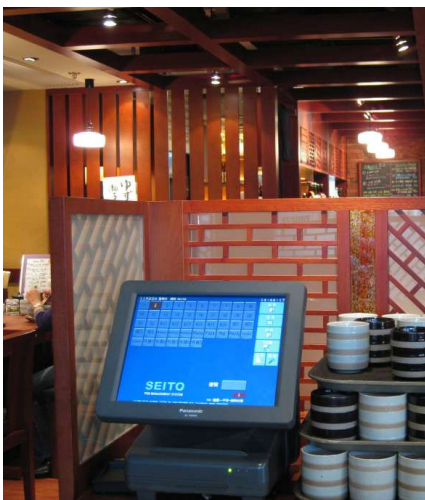
Ippei-an is using Panasonic JS-790WS POS Workstation

Seito also provides a function of “ Automatic daily sales report transmission to designated email ”. Management of Ippei-an is now very clear about business status of all branches every day even they are not in town. The management can simply review the sales report by any PDA phone in anywhere. They can understand the picture of their business without visiting all branches and can make any analysis or decision more efficiently.