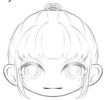
VICKY LUO (5A)

We hope that students can learn from the lions - to be brave and wise like the lions. If they dare to take the first step to learn English and face the challenges ahead, they will not be afraid to speak and use English. As the Turkish proverb on the first page of our passport says, "A lion sleeps in the heart of every man and woman." We hope students can be courageous and participate in the English activities actively.