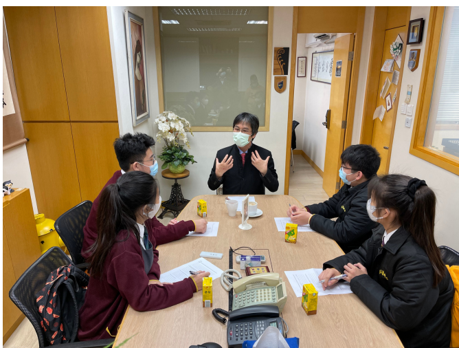
5B students gathered around the Principal's table