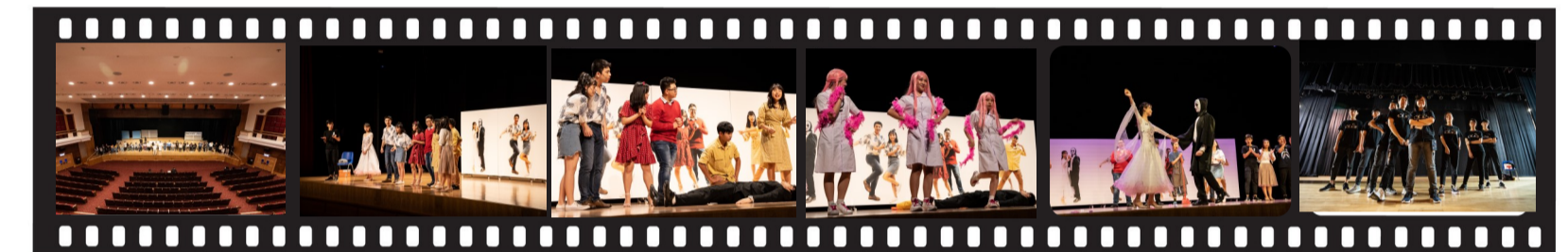
A successful performance is proof of team work. The writing of scripts, the audition, the casting and all the rehearsals...