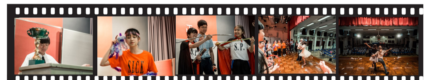
The taste of failure may be bitter, yet the glitter of our team is shining bright! We tried our best, did our best. Now, we are all winners!