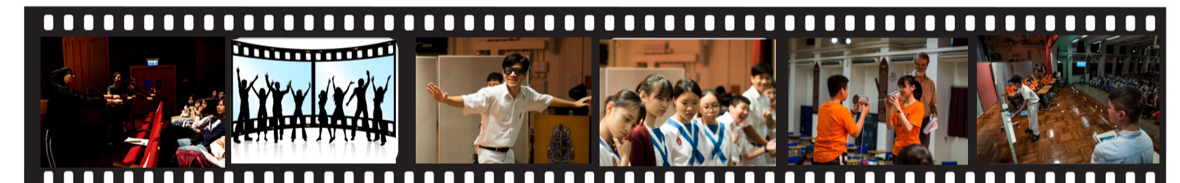
Some people think a grand performance stage is the key, but for me, the people we work with are the souls.